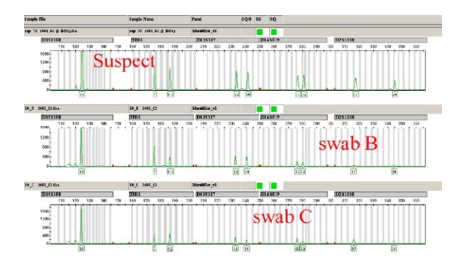
Fig. 2. Green-dye pherograms comparison between suspect and saliva evidences.

Nevertheless, two out of the three samples processed, as illustrated in the inferograms below, showed an almost complete STR profile, which was obtained from a DNA quantity ranging from 50 to 200 pg (as total DNA target in the PCR solution) (Figs. 1–4). The DNA