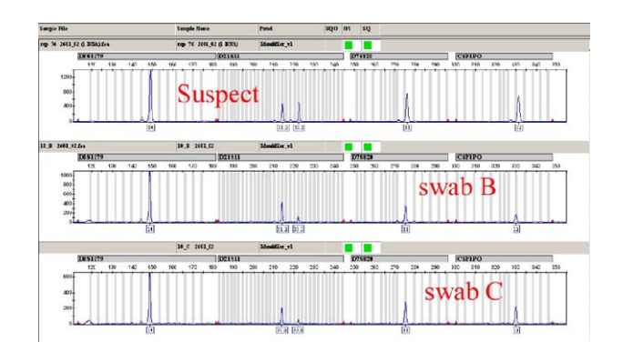
Fig. 1. Blu-dye pherograms comparison between suspect and saliva evidences.

The profiles we obtained were then compared with 16 different reference samples of potential suspects that were collected during the investigation.