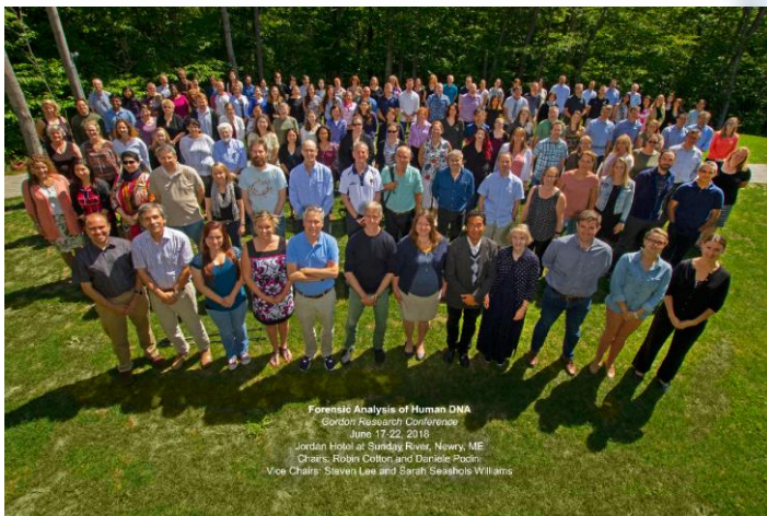
2018 GRC Symposium for Forensic Analysis of Human DNA